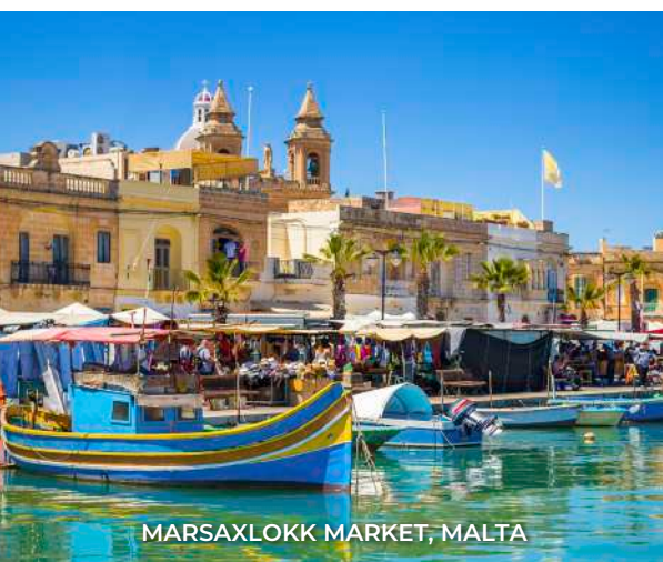
MARSAXLOKK MARKET, MALTA