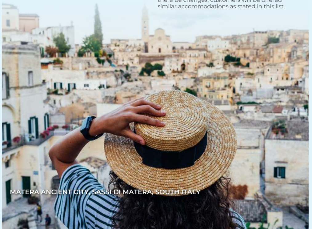
MATERA ANCIENT CITY, SASSI DI MATERA, SOUTH ITALY

* Note: Hotels subject to final confirmation. Should there be changes, customers will be offered similar accommodations as stated in this list.